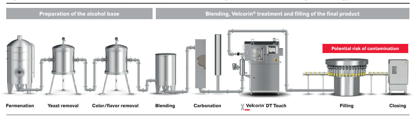
Figure 1: Schematic Hard Seltzer production process with integrated Velcorin® Dosing Technology.

Hard Seltzers have become a global trend and driver for growth (+15% p.a.). Typically, it consists of carbonated water, flavors and with an alcohol content of 3% to 6%. It comes with low or no sugar added and thus, stays in the 100-calorie range. Despite the lean recipe, the beverage with its fermentation-derived alcohol base needs microbiological stabilization to prevent spoilage.