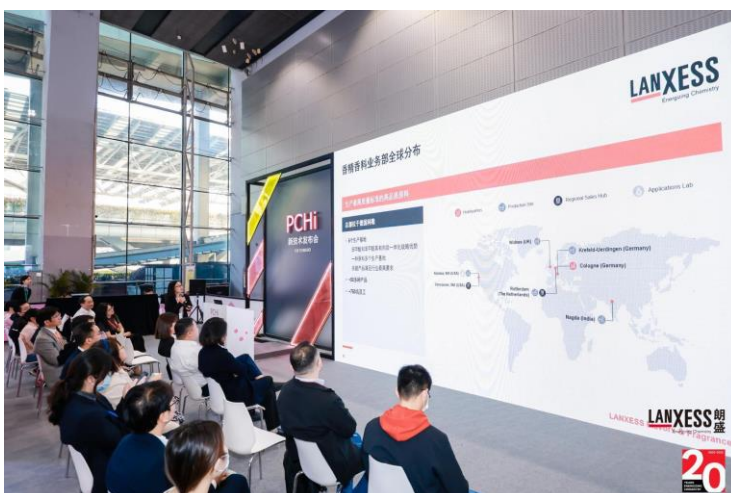
PCHi 2025 LANXESS Technology Presentation

Beyond these efforts, on February 19 from 16:00 to 17:00, LANXESS