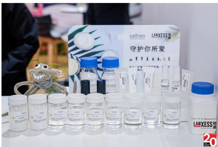
PCHI 2025 LANXESS Product Showcase

Saltigo provides an outstanding solution for personal protection: Saltidin® (also known as Icaridin or Picaridin). As a highly effective and safe active ingredient for insect repellents, Saltidin® utilizes its unique molecular structure to interfere with the receptors on insect antennae, preventing mosquitoes from recognizing humans as blood-feeding targets. This "invisibility" effect is not only effective against mosquitoes but also provides protection against ticks, flies, and various other insects.