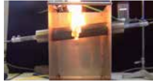
Polyalkylene glycol ignites at approx. 450°C

Reolube® Turbofluids meet or exceed all major Original Equipment Manufacturer (OEM) requirements as well as the following standards/specifications: