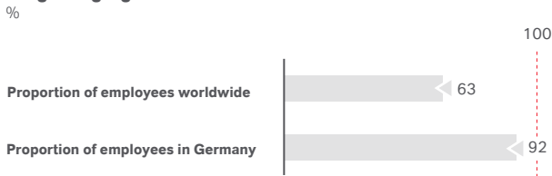
Proportion of Employees Covered by Collective Bargaining Agreements

We regularly seek to engage in a dialogue with employee representative bodies in Germany, in Europe and around the world and involve these bodies in organisational changes at an early stage. Outside Europe, too, we give high priority to fair dealings with employees.