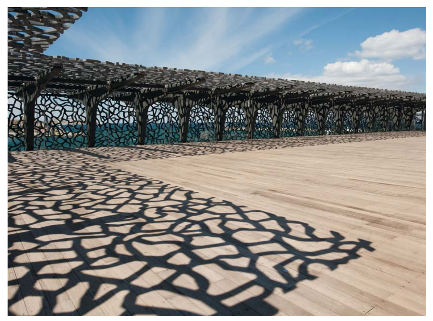
■ A museum as a transparent place for cultural and sensory experience.

ventilation, and air conditioning. In addition, the material is very long-lasting; UHPC is water resistant and also offers long-term resistance to the salty sea air of the Mediterranean. It is these characteristics that also distinguish the Bayferrox® 330 and Bayferrox® 318 used to color the concrete. Like all Bayferrox® color pigments, thanks to their outstanding light and weather resistance, they are more than capable of lasting for the concrete's estimated life cycle of at least 100 years. Thus this concrete in the color of dust, immersed in the light of the sun, shows how delicate lightness and great stability can be combined through technological brilliance.